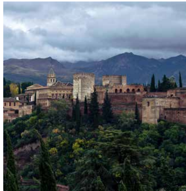
Alhambra and Generalife, Granada. Europa Nostra Award 2009.

In view of the great typological diversity of the Awards and the long period they cover, we have opted for a selection on panels grouped under the following headings: Urban Complexes and Walls; Roads and Streets; Industrial Heritage; Natural Heritage; Religious Heritage (Monasteries and Churches); Arab Heritage; Roman Heritage, Civil Heritage (Theatres and Museums, Markets and Hotels); Palaces, Houses and Towers; Management Plans, inventories and catalogues; Moveable Heritage; Publications; Institutions, People and Projects.