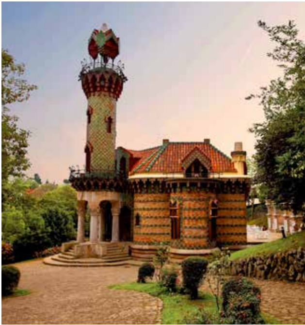
El Capricho by Gaudí, Comillas, Cantabria. Europa Nostra Award 1990.

To commemorate its forty years of history, Hispania Nostra offers a representative selection of the Europa Nostra Prizes awarded in Spain, the country with the largest number of such distinctions.