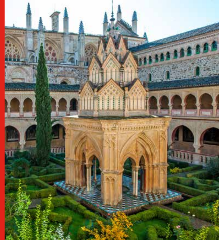
Cover: Monastery of Guadalupe, Cáceres. Europa Nostra Award 1995.