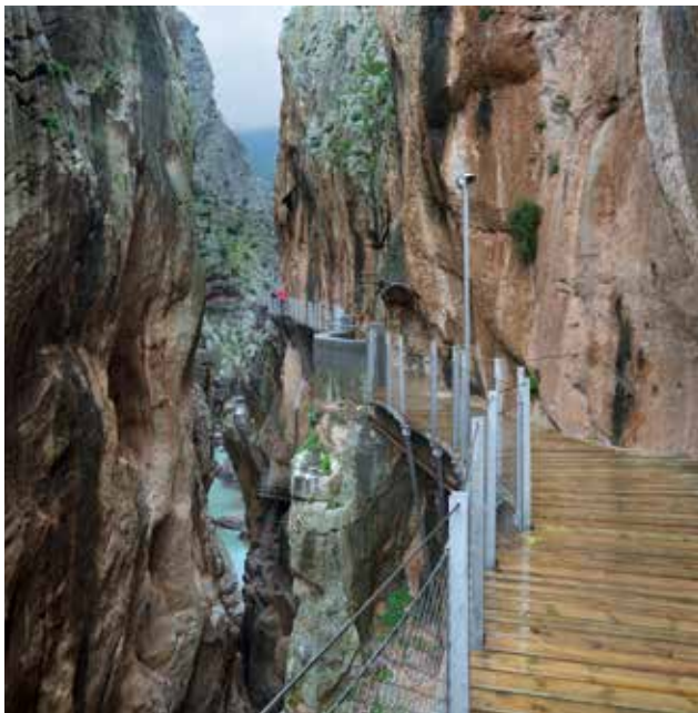
The King's little pathway in Aradales, Málaga. Europa Nostra Award 2016.